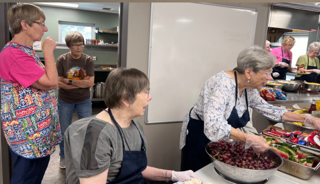
Above: FCC serves at Free Lunch on 8/24.

Pets provide valuable companionship to people across all socioeconomic statuses. Recognizing that it's often difficult to find assistance with caring for one's pets, in September, FCC is collecting pet supplies for the Coralville Community Food Pantry. You can help out by bringing their most requested items to the church through September 29 .