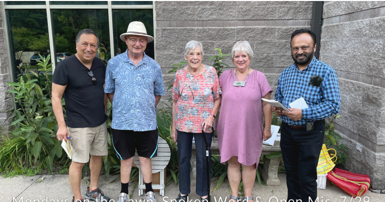
Aondays on the Lawn, Spoken Word & Op<mark>en M</mark>ic, 7/29

First Christian has put together a devotional booklet for you this fall! In this season, we are invited to "Imagine Together" what the world could be like when we choose to live from values that are good for us and for the world. This devotional is intended to be a companion on that journey. In it are readings and reflections, stories and poems that are intended to invite you to remember, to imagine, and to wonder. These will be available for pick up at the church on September 8 and will also be available electronically.