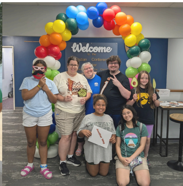
Left: FCC middle schoolers attend a Mini Mission Trip in Cedar Rapids along with 2 other churches; Right: FCC at camp in Newton.