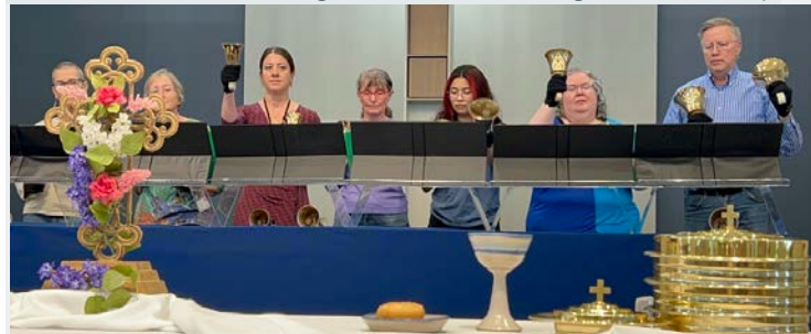
Disciples Ringers providing Special Music on May 3