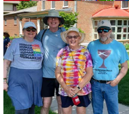
Above: 2025 PrideFest