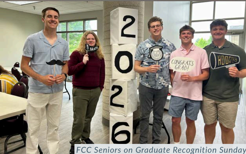
FCC Seniors on Graduate Recognition Sunday