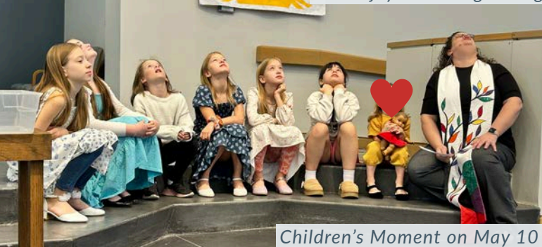
Children's Moment on May 10