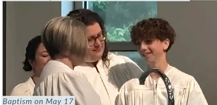
Baptism on May 17