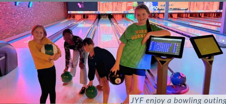
JYF enjoy a bowling outing