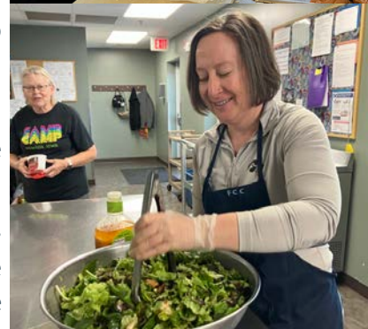
Above: Serving at FLP in April