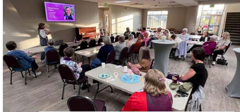
Women's Social: Spring Dreams & Flower Schemes