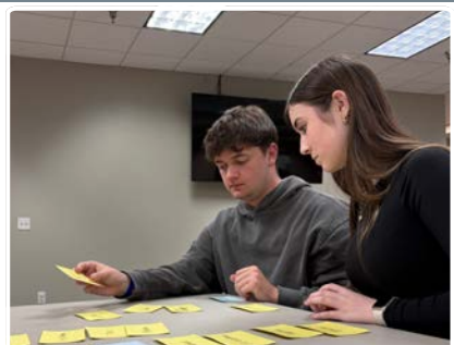
Youth studying at Baptism class