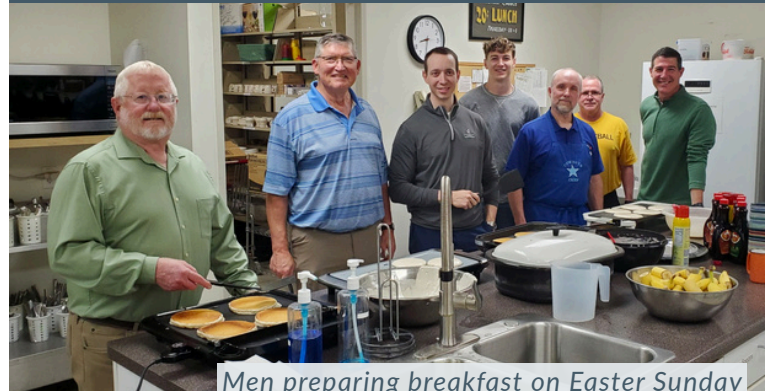
Men preparing breakfast on Easter Sunday