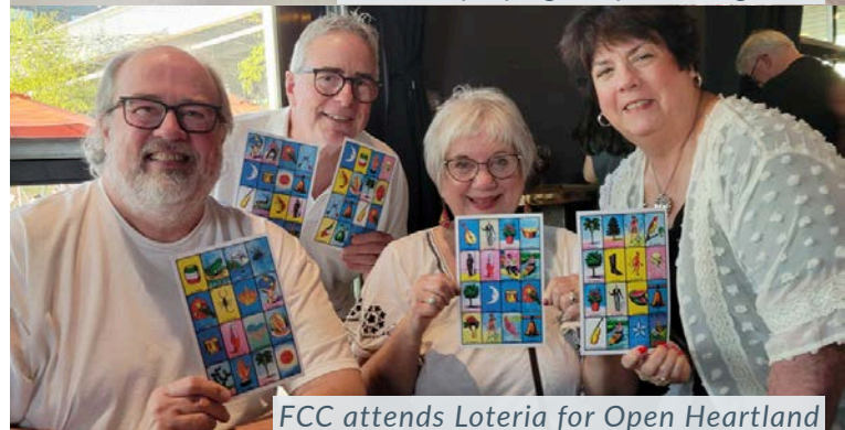
FCC attends Loteria for Open Heartland