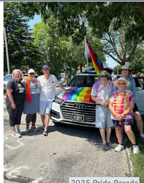
2025 Pride Parade

Pride is a powerful way to extend the message of love, welcome, and inclusion to the broader community.