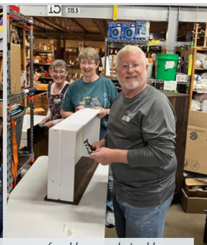
Serving at the Free Lunch Program and building dressers for Houses Into Homes.