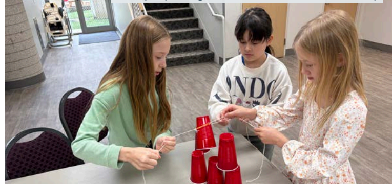
JYF kids playing cooperative games