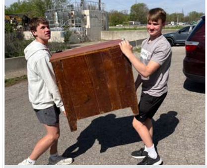
Delivery with Houses into Homes