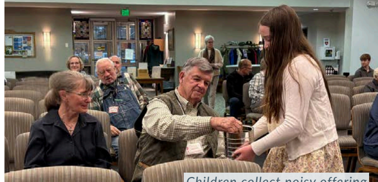
Children collect noisy offering