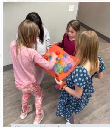
Above: Youth group games