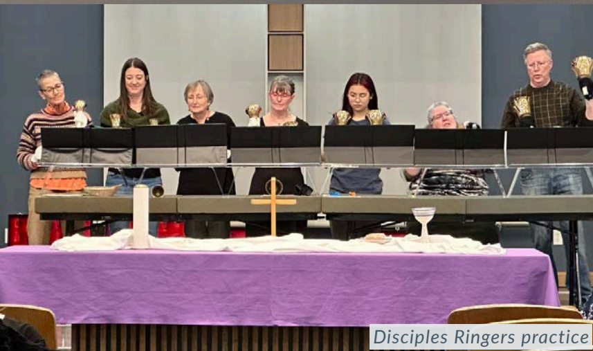
Disciples Ringers practice