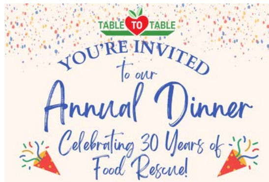
Table to Table Dinner & Fundraiser

Join local food rescue organization Table to Table Wednesday, April 22 from 5:30-7:30pm at Celebration Farm for this year's Annual Dinner and fundraiser! Gather together for food from local restaurants, games and auction items to raise funds. Tickets are $75 per person and can be purchased at www.table2table.org/dinner .