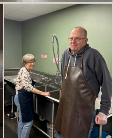
Above: FCC serves at the Free Lunch Program on Feb. 28. Below: FCC donations of household items for Houses into Homes in March.