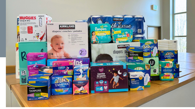
Just part of FCC's generous donation of toilet paper, baby diapers and period product for our 3 local food pantries. Thank you to all who contributed!