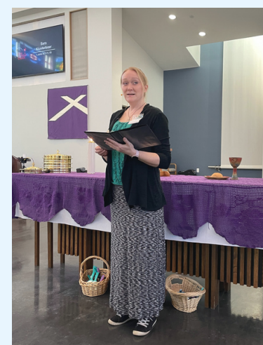
Sunday worship leaders: acolyte and scripture reader.