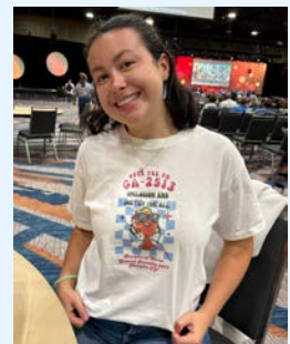
Above: A tshirt at General Assembly in support of GA-2513 (Disability Justice & Inclusion)

Curious about what was approved? Click here for details, including three emergency resolutions. Stay tuned for upcoming conversations about what these resolutions mean for our congregation!