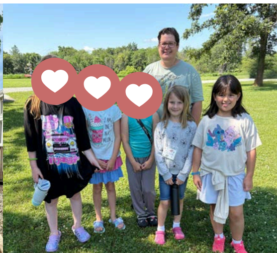
Left: FCC campers and Christian Conference Center staff after worship at FCC on 7/27. Middle/Right: Fun at camp this summer!