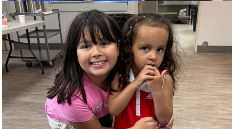
Top: Scam Me Not Fraud Presentation for FCC folks, Middle/Bottom: Friends of all ages connect at the July potluck.