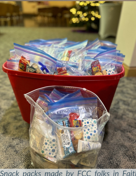
Snack packs made by FCC folks in Faith Formation for the IC Free Lunch Program.