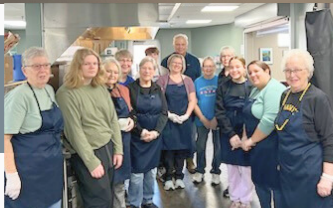
Above: FCC folks serve at the Free Lunch Program on February 24.